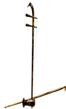
Fig. 6 Dan Nhi Troung Ngoc Thang : Traditional Musical Instrument of Viet Ethnic Group

Bowed strings instruments in Vietnam are Dan Nhi, Dan Gao, Dan Co lon, Dan Co liu.