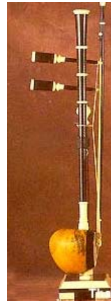
Fig. 11 Saw U http://www.thaitambon.com/tambon/tsmepdesc.[7]