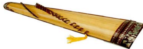
Fig. 5 Tranh zither- 16 strings Troung Ngoc Thang : Traditional Musical Instrument of Viet Ethnic Group [5]

Plucked strings of Vietnamese musical instruments, such as, Tranh zither- 16 strings, Moon-Shaped Lute or Dan Nguyet, Dan Day, Dan Bau, Dan Tam, Dan Ty Ba, etc.