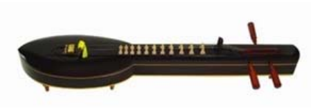
Fig. 1 Jakhay http://www.webpostthai.com/ [1]

There are many kinds of Thai musical instruments, first, plucked strings instruments, such as, Jakhay, Krajappi, Phin, Serng.