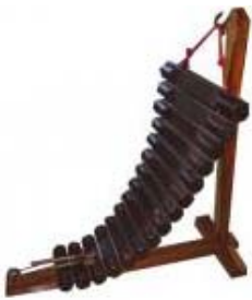
Fig. 9 Pong Lang http://ponglang.com/web/product.php [6]

There are some kinds of musical instruments which are similarity between Thailand and Vietnam, for example, Pong Lang in Thailand and T'rung - Đàn T'rung in Vietnam, Saw U and Dan Gao, Khlui and Sao ngang.