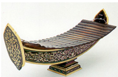
Fig. 3 Ranat Ayk

Third, Thai percussion instruments consist of Ranat Ayk, Ranat Thum, Ching, Chap, Hhawng Wong Yai, Hhawng Wong Lek, Glawng That, Taphon, Thon, Rammana, Glawng Khaek, Sawng Na.