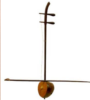
Fig. 12 Dan Gao Truong Ngoc Thang Traditional Musical Instrument of Viet Ethnic Group