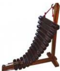
Fig. 9 Pong Lang http://ponglang.com/web/product.php [6]

There are some kinds of musical instruments which are similarity between Thailand and Vietnam, for example, Pong Lang in Thailand and T'rung - Đàn T'rung in Vietnam, Saw U and Dan Gao, Khlui and Sao ngang.