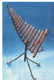
Fig. 10 T'rung - Đàn T'rung Truong Ngoc Thang Traditional Musical Instrument of Viet Ethnic Group