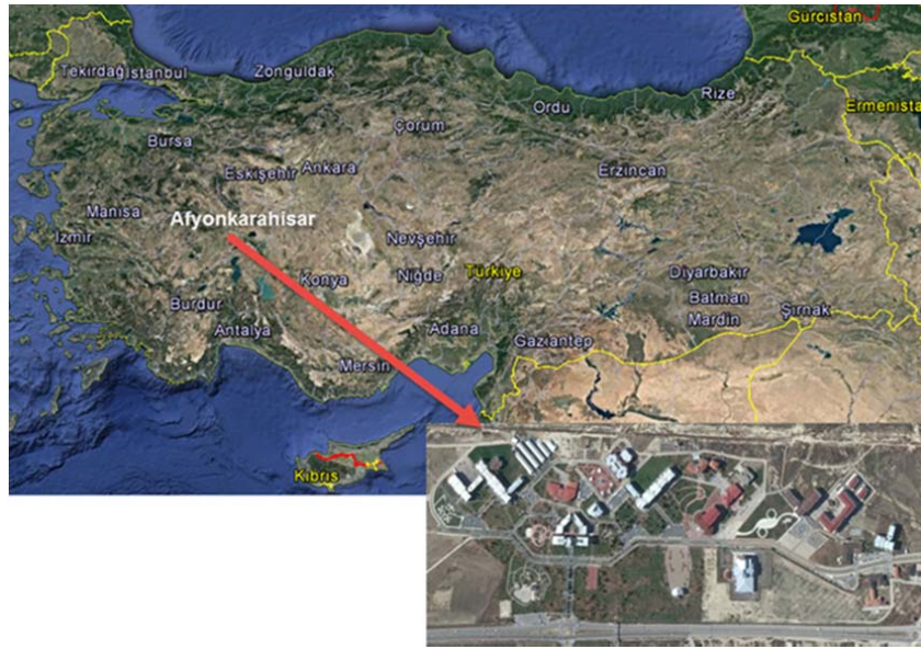
Fig. 1 The study area