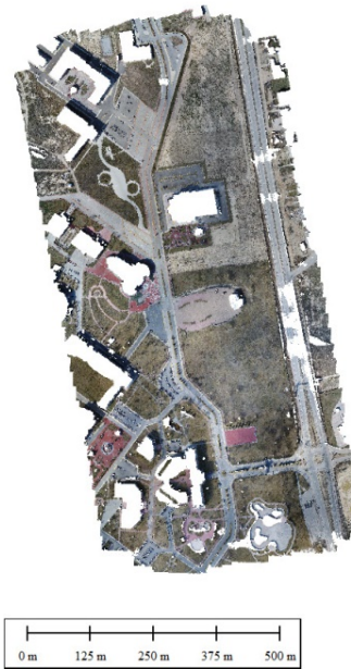
Fig. 3 Point cloud filtered by CSF (Ground point)

MEs is recorded at the centimeter level at 5% data density for random data reduction algorithm (-0.010 m). MEs are sub-centimeter at 25%, 50% and 75% data, showing that interpolation biases were negligible.