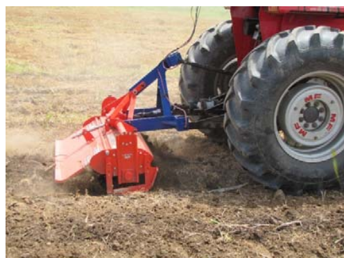
(a) Rotary tiller

Tokyo, Japan) a 16 channels strain amplifier was used to amplify the signals, recording signals were saved in the internal memory and on the laptop. For reading data from the laptop or CF card, the DCS-100A data acquisition software was applied. Statistical analysis of the split-plot design was applied to evaluate the significance of the treatment effect on mean soil clod diameter. Also the forward speed, the tilling depth, force and power parameters were statistically analyzed.