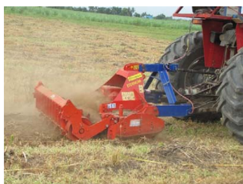
(b) Power harrow