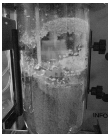
Fig. 3 Medium was filled with pellets and the filamentous fungus of freely suspended cells attached everywhere

growth medium in a bioreactor using freely suspended and immobilized cell systems. As one can observed, in freely suspended cells system, the biomass and specific growth rate were high (8.964 g/L, 0.072 1/h) at agitation rate 300 rpm, while for immobilized cell system the biomass attached onto the fibrous matrix and the specific growth rate were high (9.964 g/L, 0.085 1/h) when the agitation was kept at 100 rpm (Table I). Thus, it is showing that the agitation speed should be slower so that more cells could be attached or immobilized onto the fibrous material. At high agitation speed (300 rpm), only a few cells were attached onto the surface of the fibrous material (2.114 g/L) and the culture broth was full with filamentous cells that made the medium cloudy.