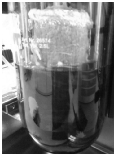
Fig. 4 Attachment of P. simplicissimum mycelium seen in the RFBB at the end of the fermentation process

As can be seen in Fig. 3, not only numerous mycelial clumps (loose pellets) and small fragments of mycelium in suspension, large clumps of mycelia were also grown everywhere in the CSTB. They attached to the sparger, probes, and culture vessel wall, hindering the control of fermentation conditions at the setting variables. These resulted in the difficulty in mixing, which in turn affected mass and heat transfer, thus causing the decreased in productivity and the increase in the production of undesirable metabolites [18]. According to Thongchul [19], the strong mechanical forces could deactivate loose mycelia at some level of magnitude. Due to that, the mycelial biomass at the end of the fermentation (48 h) was only about 38.5% of those attached cells obtained in RFBB at 300 rpm. Thus confirming that RFBB was superior in supporting cell growth by immobilizing (adsorption) the mycelia onto the supporting matrix attached onto the rotating shaft of the bioreactor at slower agitation speed (100 rpm). According to Xu and Yang [13], RFBB provided the advantage of controlling mycelial growth and morphology of P. brevicompactum during the fermentation of mycophenolic acid.