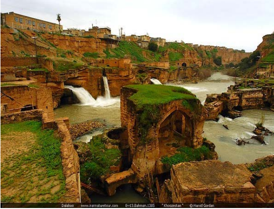
Fig. 5 Shoush city in Iran with its bridges and dams is one of the most important centers in water management

By building dams, bridges and stone walls on the rivers around the city or by construction of handmade canals and collection of runoffs and water of creeks and small and seasonal lakes in water depots, the running water was used optimally. After building the dam, the amount of water behind the dams was controlled by a building called “Kolah Farangi” and a person called “Mirab” supervised the usage of the water bodies [9]. In dry lands with low rain, underground water has a very important role in the formation of the habitats and the continuation of life of the people. Extraction of the underground water was performed through the very innovative technique of digging Qantas [12].