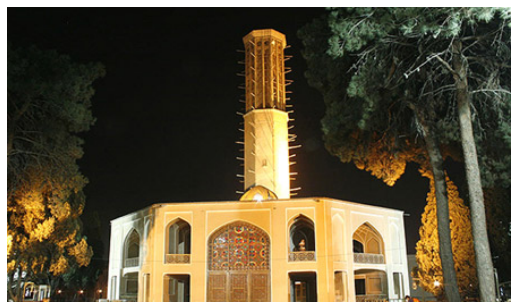
Fig. 2 Windward is one of the key elements of Iranian architecture. This is the Dolat Abad wind ward and the highest one in the world [11]

Windward is another masterpiece of the Iranian architecture which is created to match the ecological cities environment (Fig. 2). Windward is the main natural method of ventilation in the buildings which has been designed regarding the speed and direction of the wind. After passing the upper surfaces, wind is directed into channels which are connected to the water in the Qantas or the aqueduct water in the cellar. In this