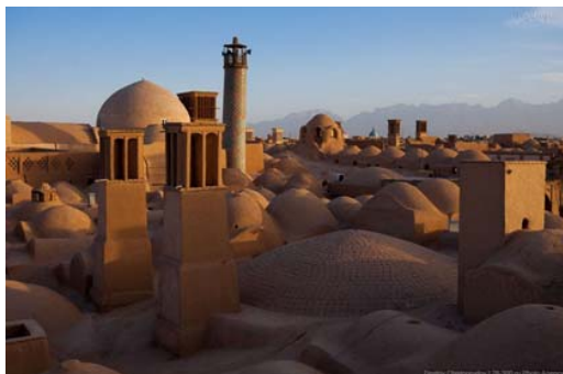
Fig. 1 A view of a traditional pattern in Yazd (city in center of plateau of Iran). Domical roofs minimized possibility of heat exchange in dry and hot regions [10]

Use of renewable energies such as wind and solar energies is another characteristic of the mentioned regions. Buildings are designed for four seasons; they benefit from the maximum temperature in the winter and the minimum temperature in summer. Furthermore, the basement (Sardab) and Shuvadon were built normally in the summer-living part and had several floors underground to reduce the temperature around 15 to 20 °C. In some of the houses, a branch of the aqueduct passed through the cellar and provided easy access to the water [9], [7].