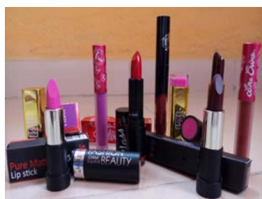
Fig. 1 Lipstick samples analysed in this study

The original lipstick samples were analysed first, after which the first set of tea cups were swabbed immediately, and analysed accordingly. The second and third sets of cups were left in the open laboratory and labelled appropriately. The lipstick smears on these cups were swabbed after two weeks, and four weeks respectively, then analysed accordingly.