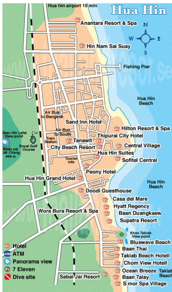
Fig. 1 Hua Hin community and the local nearby areas

Hua Hin, as shown in Fig. 1, the area map of Hua Hin, Prachaup Khiri Khan Province, Thailand is considered an area that has been highly development in the various fields such as tourism and economic of the area’s rapid growth.