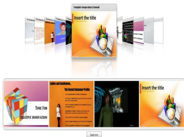
Fig. 2 Collaborative Web Editor

start, maintaining the established order. The user just has to define the order of the elements and when saves it, the system takes the information of the different files and saves in a resultant file.