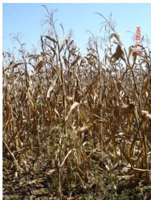
Fig. 2 Biomass remained in the field

\text{g}_{\text{dm}}/\text{m}^2 ). The collected samples were used as a fuel for simulating open burning experiment in the chamber.