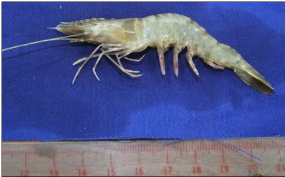
Fig. 10 Penaeus semisulcatus