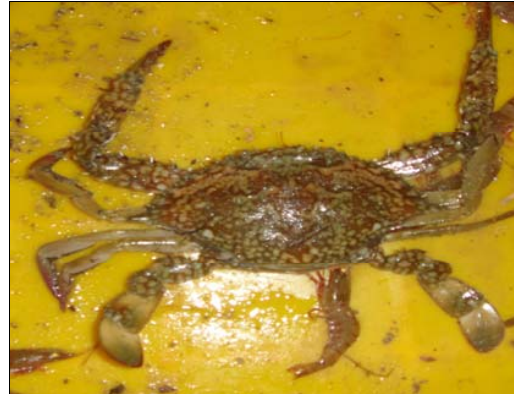
Fig. 12 Portunus pelagicus