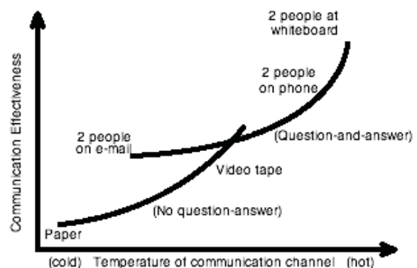
Fig. 1. Effectiveness of different communication channels, based on [10]

Figure 1 shows a graph comparing richness of different communication channels. Paper, for example, is a cold communication channel, as it does not have questions and answers, so is not interactive. On other hand, two people exchanging ideas at a whiteboard is a hot (rich) communication channel. Thus it would be preferable to use warm to hot communication channels to reduce the cost of detecting and transferring information in software development projects.