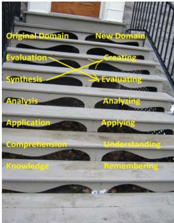
Fig. 1. Schematic view of original and revised version of cognitive domain