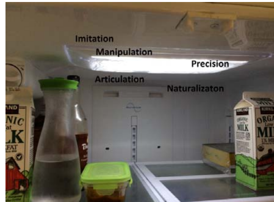
Fig. 3 Schematic view of psychomotor domain

Consider the possibility of a broken filament. Otherwise the socket needs to be checked.