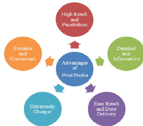
Fig. 1 Several Advantages of Print Media