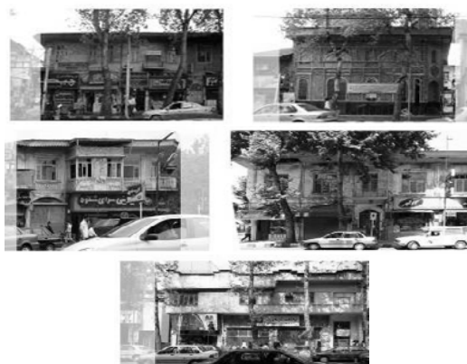
Fig. 3 Historical building facades with highest mean

As indicated in Table I, the design and shape of building facade are the most important factors as participants mentioned. The second elements are coordination between old buildings and modern buildings, which got second mean. As mentioned ready, the analysis of data carried out by the means of contents analysis and Kendall's tau, a measure of correlation analysis (to explore relationship between the evaluation of historical facades and facade's architectural and urban elements through people evaluation to know which elements impressing people evaluation). Refer to Table II. Smith M, Hardy RB, delineated Content analysis is a technique, which allows a quantitative analysis of seemingly qualitative data. In next step, the correlation between architectural elements such as color, material, shape and design, and architectural style with historical building facade with highest mean has studied.