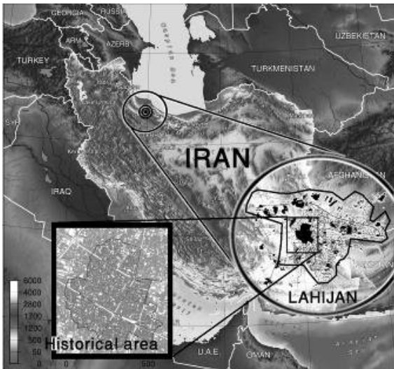
Fig. 1 Study area and location in North of Iran

Historical area are lied on most Iran cities as well as other cities in other countries, building's facades at Karimi street in Lahijan city, located at historical area, was studied as place, where have various architectural samples as modern and traditional style (Fig. 1 and Fig. 2).