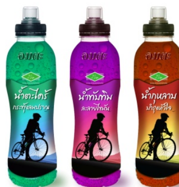
Fig. 14 Personality Approach on the Category of Beverages, Desserts and Snacks

The brand Identities of Thai Halal brands with the personality approach. The reflection of consumers thought. The Personality feedback to them after they were consumes this product such as; generation of digital edge. Modernism look, active, funny and joyful person, urbanism look and multicultural celebrity, sport man look, progressive thinking person. The brand identity created transform to the packaging design should be enjoyable, merry, flamboyant, charming, dreamy look, using a humoristic story and dazzling image as on Fig. 14.