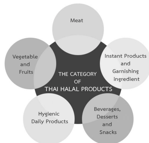
Fig. 1 The Category of Thai Halal products

Furthermore every Muslim must follow the ethic (Ishan). One of Ishan is Halal; the laws regarding which foods can and cannot be eaten and also on the proper method of slaughtering an animal for consumption. All Muslims have to observe the Halal. A variety of substances are considered as harmful (haram) for humans to consume and forbidden according to Qur'anic verses: pork, blood: all carnivorous and birds of prey, alcohol and other intoxicants, food over which Allah's name is not pronounced etc. Halal and Haram are universal terms that apply to all facets of life. They are especially related to food products, food ingredients and food contact materials and cosmetics and products of personal care [2]; as on Fig. 1.