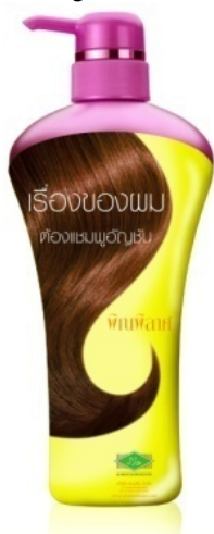
Fig. 16 Value Approach on the Category of Hygienic Daily Products

The brand Identities of Thai Halal brands with the value approach. The value of products that affect to consumers perception such as: it is a product of expertise, friendly for all. It is the products of trusty manufacturer. Consumer always comes first as priority service. It is healthy products that accumulate quality of life. Manufacture of research. It is an up to date products. The brand identity created transform to the packaging design should be sincere, enjoyable, merry, flamboyant, charming, dreamy look, using a humoristic story and dazzling image as on Fig. 16.