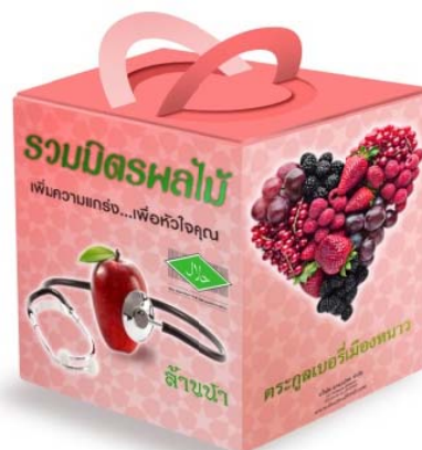
Fig. 8 Personality Approach on the Category of Vegetable and Fruits

The brand Identities of Thai Halal brands with the benefit approach. Consumers will purchase this product with the reason of; fresh and clean materials, there are no toxic or chemical residues; it is a beneficial nutrients product, there are standard of manufacturing and manufacturer's credit. The brand identity created transform to the packaging design should be clear, see through and display a reasonable product as on Fig. 9.