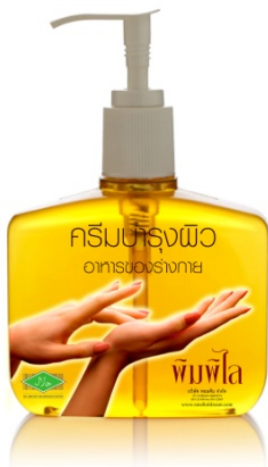
Fig. 15 Benefit Approach on the Category of Hygienic Daily Products

The brand Identities of Thai Halal brands with the value approach. The value of products that affect to consumers perception such as: it is a product of expertise, friendly for all. It is the products of trusty manufacturer. Consumer always comes first as priority service. It is healthy products that accumulate quality of life. Manufacture of research. It is an up to date products. The brand identity created transform to the packaging design should be sincere, enjoyable, merry, flamboyant, charming, dreamy look, using a humoristic story and dazzling image as on Fig. 16.