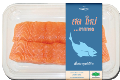
Fig. 3 Benefit Approach on the Category of Meat

The brand Identities of Thai Halal brands with the benefit approach. Consumers will purchase this product with the reason of; it is beneficial nutrients product, there are no toxic or chemical residues, fresh and clean materials. The brand identity created transform to the packaging design should be clear and display a fresh product as on Fig. 3.