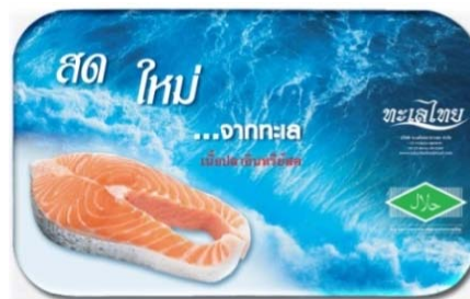
Fig. 4 Value Approach on the Category of Meat

The brand Identities of Thai Halal brands with the value approach. The value of products that affect to consumers perception such as: it is healthy products, accumulate quality of life. It is a product of expertise, manufacturing of research result. Consumers are important. It's sincere, honest and reliable to all. The brand identity created transform to the packaging design should be simply look and using a trustful image as on Fig. 4.