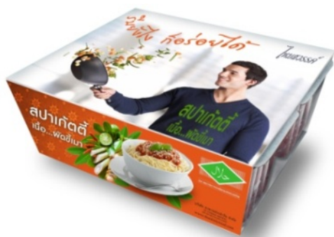
Fig. 11 Personality Approach on the Category of Instant Foods and Garnishing Ingredient

The Personality feedback to them after they were consumes this product such as; they are urbanism looking and multicultural celebrity. They are health care persons. Modernism look, active look and news additive person, thoughtful person like a progressive thinking and social activist. The brand identity created transform to the packaging design should be enjoyable, merry, flamboyant, charming, dreamy look, using a humoristic story and dazzling image as on Fig. 11.