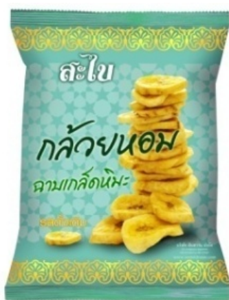
Fig. 12 Benefit Approach on the Category of Beverages, Desserts and Snacks

The brand Identities of Thai Halal brands with the benefit approach. Consumers will purchase this product with the reason of; fresh and clean materials, it is beneficial nutrients product. There are good taste, great smell and natural color. There are no toxic or chemical residues, standard of manufacturing and manufacturer's credit. The brand identity created transform to the packaging design should be simply look, represent the origin, story of the manufacturer and using a trustful image as on Fig. 12.