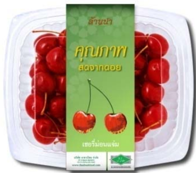
Fig. 6 Benefit Approach on the Category of Vegetable and Fruits

The brand Identities of Thai Halal brands with the value approach. The value of products that affect to consumers perception such as: it is the products of trusty manufacturer, healthy products, accumulate quality of life, the product of expertise, manufacturing of research result. Consumers are important. It is sincere service, honest and friendly to all. The brand identity created transform to the packaging design should be simply look, represent the origin, story of the manufacturer and using a trustful image as on Fig. 7.