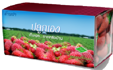
Fig. 7 Value Approach on the Category of Vegetable and Fruits

The brand Identities of Thai Halal brands with the value approach. The value of products that affect to consumers perception such as: it is the products of trusty manufacturer, healthy products, accumulate quality of life, the product of expertise, manufacturing of research result. Consumers are important. It is sincere service, honest and friendly to all. The brand identity created transform to the packaging design should be simply look, represent the origin, story of the manufacturer and using a trustful image as on Fig. 7.