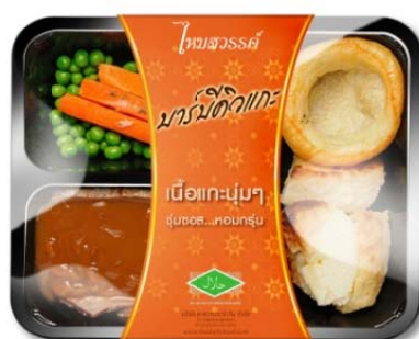
Fig. 9 Benefit Approach on the Category of Instant Foods and Garnishing Ingredient