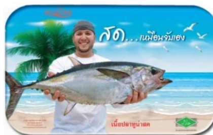
Fig. 5 Personality Approach on the Category of Meat

The brand Identities of Thai Halal brands with the personality approach. The reflection of consumers thought. The Personality feedback to them after they were consumes this product such as; they are health care persons. They are the rational person, moral person, justice person and thoughtful person like a progressive thinking. The brand identity created transform to the packaging design should be sincere, enjoyable, merry, flamboyant look and using a humoristic image as on Fig. 5.