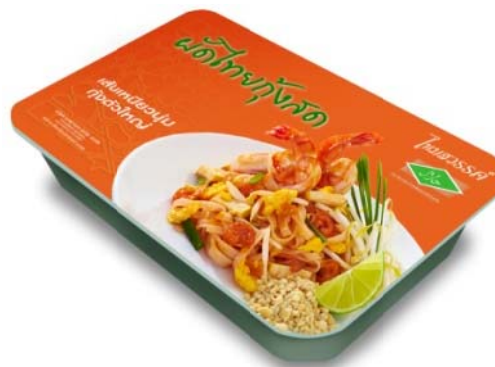
Fig. 10 Value Approach on the Category of Instant Foods and Garnishing Ingredient

The brand Identities of Thai Halal brands with the value approach. The value of products that affect to consumers perception such as: it is an up to date product, it is a product of an expertise, healthy products. It is the products of trusty manufacturer, there are the great origin and classic legend. The brand identity created transform to the packaging design should be simply look, represent the origin, story of the local culture and cuisine, using a dandy image as on Fig. 10.