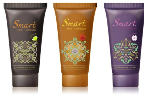
Fig. 17 Personality Approach on the Category of Hygienic Daily Products

enjoyable, merry, flamboyant, charming, dreamy look, using a humoristic story and dazzling image as on Fig. 17.