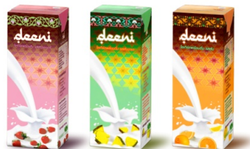
Fig. 13 Value Approach on the Category of Beverages, Desserts and Snacks

products. It is the products of trusty manufacturer, a product of expertise, environment friendly. The brand identity created transform to the packaging design should be sincere, enjoyable, merry, flamboyant, charming, dreamy look and using a humoristic image as on Fig. 13.