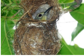
Fig. 1 Brown-throated Sunbird's Nest