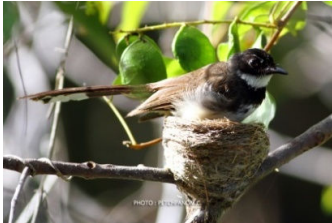
Fig. 2 Pied Fantail's Nest