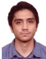
His main research interests are Multimedia Forensic and Information Security.