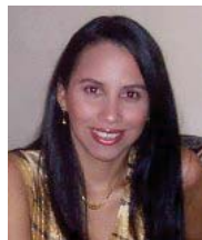
Networks and Computer Security.