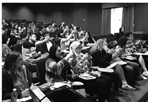
Fig. 1 Students interacting with the AR app

On being prompted, the students were very keen to get their mobiles out and try the application. There was a definite buzz of excitement in the class whilst the students engaged with the images, videos and models (see Fig. 1).