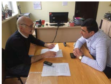
Fig. 3 Sociological Survey in Tetrtskaro Municipality

Considering the goal and the objectives of the study, qualitative research method was used. Survey was conducted using focus group (group discussion) method. Group discussions were organized prior to the survey by key personnel of the project in collaboration with local municipalities. Each focus group consisted of 6-8 locals who were intensively engaged in agricultural activities. A guideline for the group discussions was designed by the key personnel (sociologist) of the project in collaboration the experts from the relevant area of the study. The semi-structured guideline included approximately 15 questions. The focus groups were led by a moderator. In total 4 focus groups will be conducted in Tetrtskaro municipality: One focus group was conducted in municipality center and 3 focus groups were conducted in different villages of the municipality. The lengths of the discussions were around 1.5 hours. The focus group discussions were recorded on an audio tape. Recorded group discussions were transcribed. Obtained data was analyzed in the framework of code categories developed based on transcripts. Survey followed all ethical standards of the social research. The study shows that only some of the settlements of the municipality have integrated water supply system.