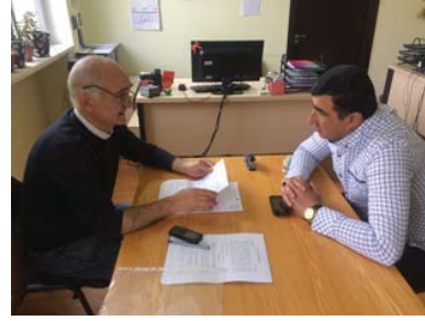
Fig. 3 Sociological Survey in Tetrtskaro Municipality

Considering the goal and the objectives of the study, qualitative research method was used. Survey was conducted using focus group (group discussion) method. Group discussions were organized prior to the survey by key personnel of the project in collaboration with local municipalities. Each focus group consisted of 6-8 locals who were intensively engaged in agricultural activities. A guideline for the group discussions was designed by the key personnel (sociologist) of the project in collaboration the experts from the relevant area of the study. The semi-structured guideline included approximately 15 questions. The focus groups were led by a moderator. In total 4 focus groups will be conducted in Tetrtskaro municipality: One focus group was conducted in municipality center and 3 focus groups were conducted in different villages of the municipality. The lengths of the discussions were around 1.5 hours. The focus group discussions were recorded on an audio tape. Recorded group discussions were transcribed. Obtained data was analyzed in the framework of code categories developed based on transcripts. Survey followed all ethical standards of the social research. The study shows that only some of the settlements of the municipality have integrated water supply system.