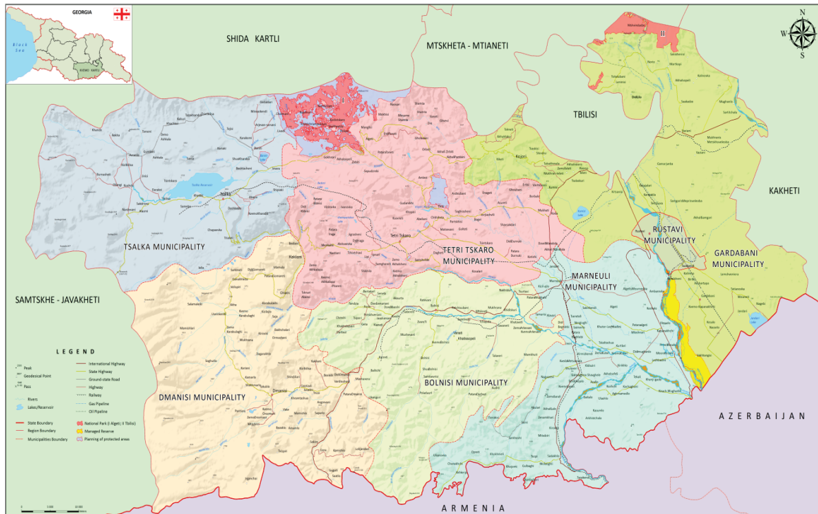
Fig. 4 Study Area