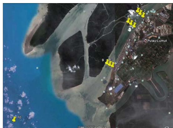
Fig. 1 Location of the sampling stations in West Port Malaysia

West Port is one of the Malaysia's principal gateway and busiest port with 22 berths. West port has been developed along the Klang strait and it is well sheltered by surrounding mangrove Islands. In this project, study area is restricted to narrow corridor between Klang Island and Che Mat Zin Island on the west of the Indah Island, 10 points are defined in this project "Fig. 1". The study area lies within humid tropical part with rainy season (North monsoon, November to March) and dry season [4]