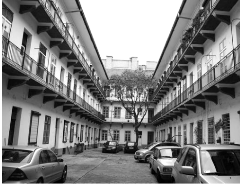
Fig. 7 Larger inner courtyard in the Jewish Quarter of Pest