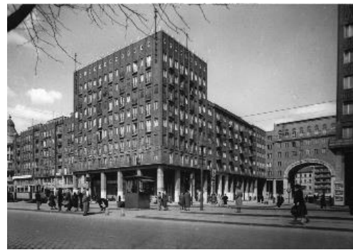
Fig. 8 Opening of Madách Boulevard the older buildings can still be seen through the gate motif [9]

The project of Madách Sugárút (Madách Boulevard) has been the most grandiose intervention in the mainly organic structure. The idea of the first so called Erzsébet (referring to Queen Elisabeth again) then later Madách Boulevard was first introduced in the beginning of the 20 th century. The concept was to open a main road to rival the nearby Andrásy Boulevard, which is ever since its opening has been the most important avenue of the area. Several plans were created, from which in 1930's, the complex of 11 interlocking buildings were built with a great gate motif to open up the densely built in inner parts. The plan however halted here, and only the beginning of the boulevard was built (Figs. 8, 9) [8].