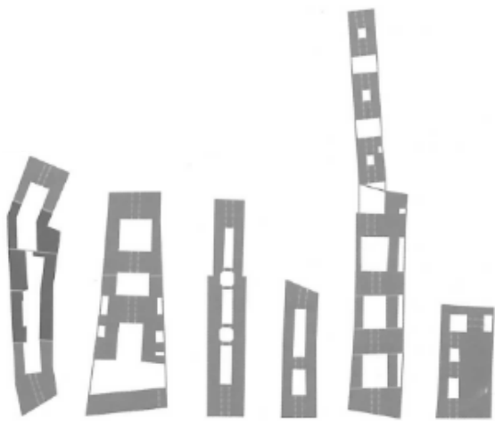
Fig. 3 Passage houses- chain layout connecting the streets and opening up the deep block for commercial life [2]

The darkest period of the city was undoubtedly – as of all Europa's- the time of the Holocaust. The traditional Jewish Quarter of Pest became a ghetto in December of 1944.