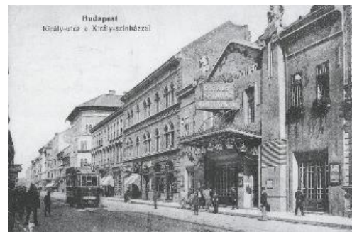
Fig. 5 Király Street, the main street of Jewish Quarter of Pest, archive photo [6]

The diversity of the houses is also increased by the combination of more and less ornate buildings (Fig. 5), as well as the mixture of apartments with and without the modern conveniences, resulting diverse social groups living side-by-side.