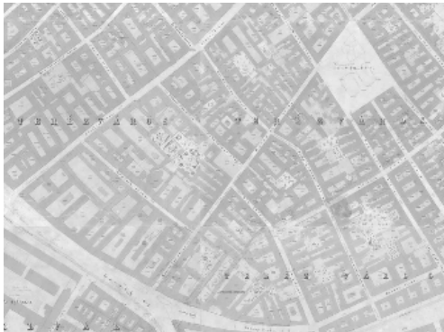
Fig. 2 Characteristic urban fabric of the turn of the 19 th and 20 th century in the district [4]

supported the faster, smoother, hidden way to reach the synagogues. The daily practice of religion was carried out in praying rooms of apartment buildings [2].