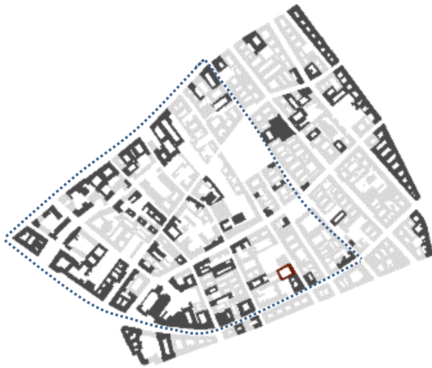
Fig. 12 Buildings under individual protection is shown with darker shade, the UNESCO buffer one area is marked by dotted line. It is also a conservation area. Based on [7]

furnishing. A listed or protected historical building is registered and declared protected by law [14].