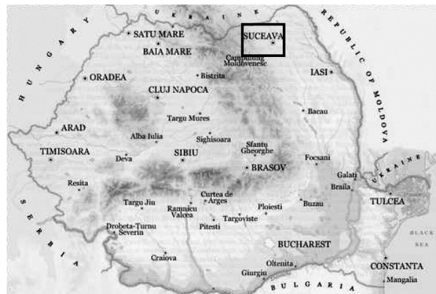
Fig. 1. The geographical position of Suceava on the present map of Romania

From such a perspective, Suceava's example might appear as an expressive illustration of how a medieval site, located on a major river, in a geographical area with a high economic and demographic potential, manages to become the center of convergence of the entire region. This happened in the spite of the city's quite unfavorable, somewhat withdrawn positioning in relation to the principal axes of the international trade [5].