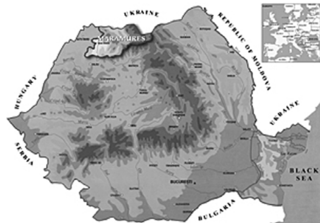
Fig. 3. Territory of Maramureș on the present map of Romania

Thus, adding this clarification to the other information provided by Ottokar's chronicle, it may be concluded that the most likely location of Otto's detention could actually be the Maramures Country (Fig. 3), possession of the Hungarian crown and also placed in the close proximity of Halicz [22].