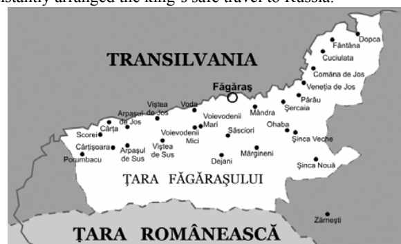
Fig. 2. Fagaras Country in its geographical relationship with Transylvania and Wallachia

a. The vicinity of the Romanians "beyond the mountains" with the Halicz principality, suggested by the fact that Otto, just released from prison (1308), expressed the desire to go to Halicz, but also by the reaction of the Romanian ruler, who instantly arranged the king's safe travel to Russia.