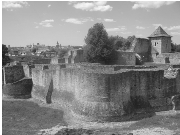
Fig. 5. Suceava. Current image of the princely fortress

Without any reappraisal of already presented arguments [41], one should fully agree to M. D. Matei's assessments of the 1384-1387 interval, as representing the period in which Moldavia's capital moved from Siret. Although the available