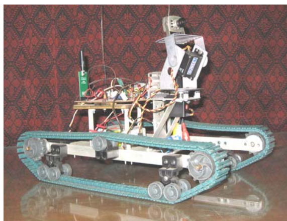
Fig. 4 The complete robot unit with the pan-and-tilt mechanism for better navigation