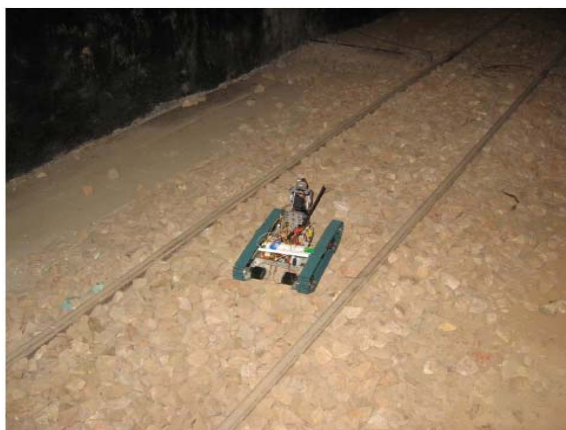
Fig. 3 The robot in the testing mine gallery of the department