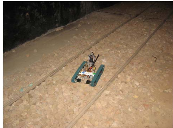
Fig. 3 The robot in the testing mine gallery of the department