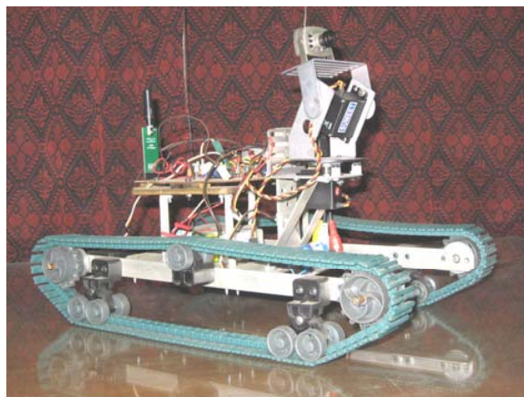
Fig. 4 The complete robot unit with the pan-and-tilt mechanism for better navigation