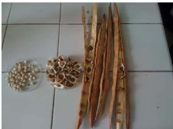
Fig. 1 Moringa oleifera

Coagulation trials were carried out using a conventional Jar test apparatus (flocculator) with six beakers. Each one was filled with 1 liter wastewater.