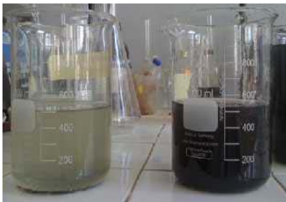
Fig. 3 Secondary wastewater clarified by Moringa oleifera

The trend of the curve reflecting the influence of dose of Moringa oleifera on the residual turbidity may be related to the coagulation function of Moringa oleifera thanks to its active components called cationic peptides of molecular weight of 6 to 16 kDa and isoelectric pH value of 10. Indeed, Moringa oleifera with its high cationic property is expected to neutralize the negative charges on the surface of particles. Even, Moringa oleifera cationic properties facilitate the adsorbing the particles causing an inter-particle collisions leading to the micro-bridge formation and hence improve effective water treatment [17]. Shapally [18] has reported that Moringa oleifera seed extract resulted in better settling of particles due to charge neutralization aiding particles to adhere each other forming larger particles, thus they settle very fast.