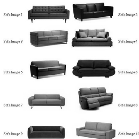
Fig. 2 Ten Selected Sofa Image

Sofa Image (Whole Product Image): sofa images, which represent the concept of the whole of its parts, were selected as the objects of study. A hundred sofa images were gathered from five leading furniture and decoration magazines in Thailand during 2010 – 2011. The paper cards of hundred sofa images printing in gray color scale in A4 size were made. The furniture designers invited to evaluate the sofa image cards in this study consisted of two male and one female furniture designers with more than five years experience in the field of sofa design. The designers compare the similarities and differences in term of external appearance, and finally selected ten sofa images that would be used as the representation of this study. The final set of sofa images was shown in figure II.