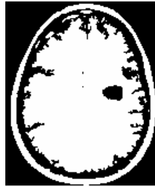
Fig. 1 (b) Magnetic Resonance (MR) image of the brain after applying Fuzzy Kohonen neural network