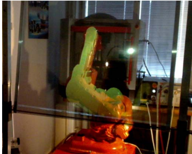
Fig. 2 Virtual model copying the position of real device – displaying the combination of real and virtual image using the AR

connection of two seemingly different views it creates an ideal platform for creation of realistic spatial effect.