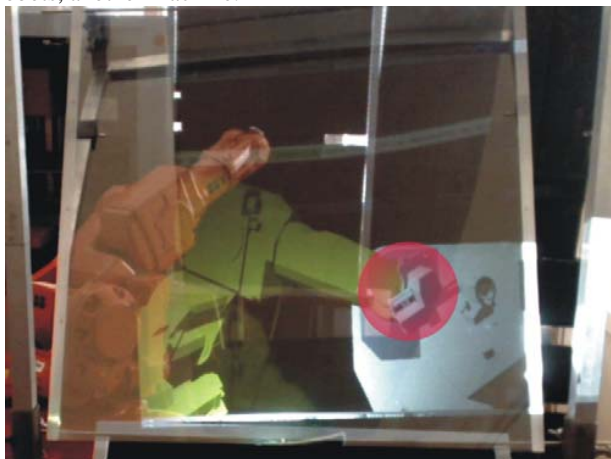
Fig. 3 Warning display: Collision Threat with placement shown

Thanks to the combination of real and virtual complex data, the programmer has in his field of view the image combined from real objects, such as devices, lathe, mill, etc; and also from virtually inserted models, for example the robot, group of robots, another machine.