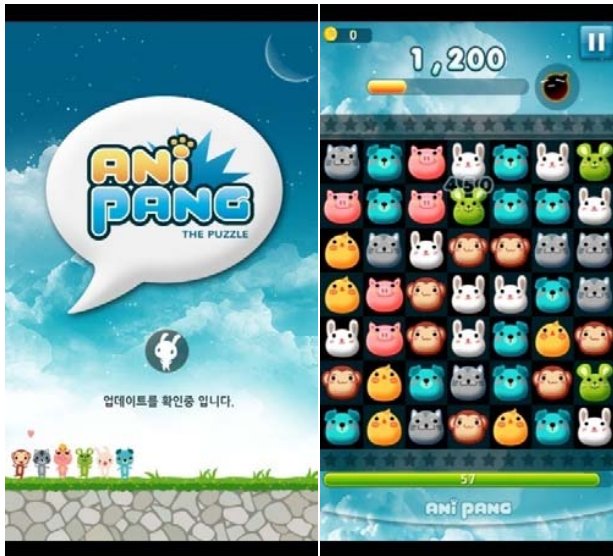
Fig. 1 ANIPANG

equivalent scores of each case. The score depends on the type and number of animals.