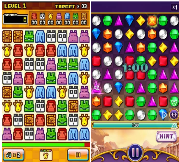
Fig. 2 Zookeeper (Left) & Bejeweled Britz (Right)