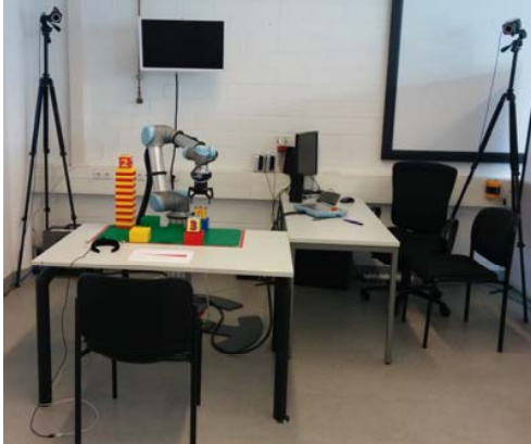
Fig. 2 Experimental setup, UR5 robot with gripper, screen, hairband with IMU, and motion capture cameras

system (x, y, z). The seven degrees of freedom of the robot (with gripper) are transferred on the basis of a control paradigm to the three degrees of freedom of the human head by means of four control groups (horizontal plane, vertical plane, orientation in space, gripper) [21].