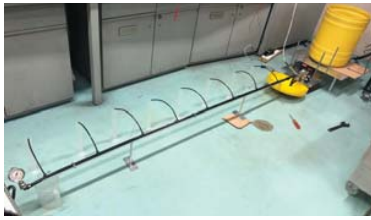
Fig. 3 Experimental test-bench

The results of the experiment conducted to determine t(p \rightarrow p_{atm}) are reported in Table I. Next, the actual pump activation time computed using (7) was 53.26s. Then, a new experiment was performed to characterize the system after its calibration. The system was started with the distribution line full of NS and the new t_{pump-on} was set for pump activation time. The obtained results are reported in Table V. The RMSE and UC obtained from each repetition of the experiment were computed and shown in Table II. The repeatability of the system was calculated using (4) through (6). The following results were obtained: