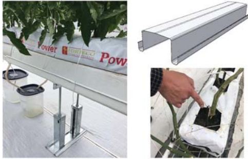
Fig. 2 Implemented Distribution Module