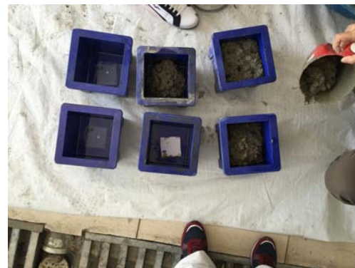
Fig. 6 Preparations of molds before installation