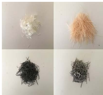
Fig. 1 Synthetic and steel fibers

The formula mentioned above is used to calculate the dynamic modulus of elasticity of concrete samples. Poisson ratio of concrete was taken as 0.2 for all concrete samples for this study. Mechanical properties of concrete mixtures acquired from test results are given in Table III.