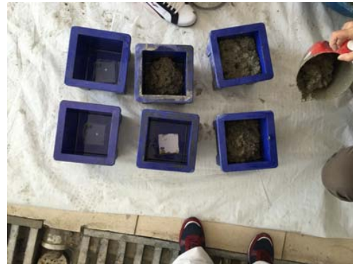
Fig. 6 Preparations of molds before installation

Based on the objective of this study, investigating of UPV for hybrid fiber reinforced concretes, various results are obtained as a result of this study. The UPV testing may not be regarded as a challenging test method compared to other conventional destructive test methods. The main reason of this that to check the quality of concrete depend on several factors such as fiber volume, fiber orientation, slenderness ratio of fibers, etc. Therefore, this study shows that there is no obvious trend between the UPV values and density. Similarly, when fiber volume is increased for hybrid fiber concrete mixtures, it is not seen to be a clear decrease the UPV values of hybrid fiber reinforced concrete mixtures. However, it can be said that the UPV values are higher for smaller fiber volume fractions than larger ones.