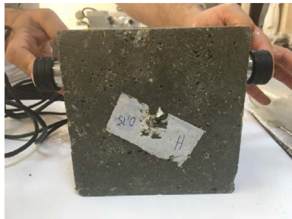
Fig. 2 UPV Testing System