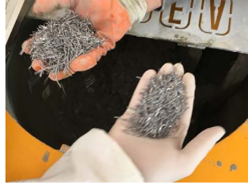
Fig. 4 Mixing process