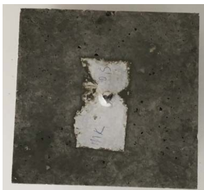
Fig. 5 Cube specimens before compressive strength test