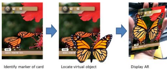
Fig. 2 Procedure of processing an AR interactive game card

then display the models and graphics on the screen. The players can then view a combination of the video image and three-dimensional models on the display.