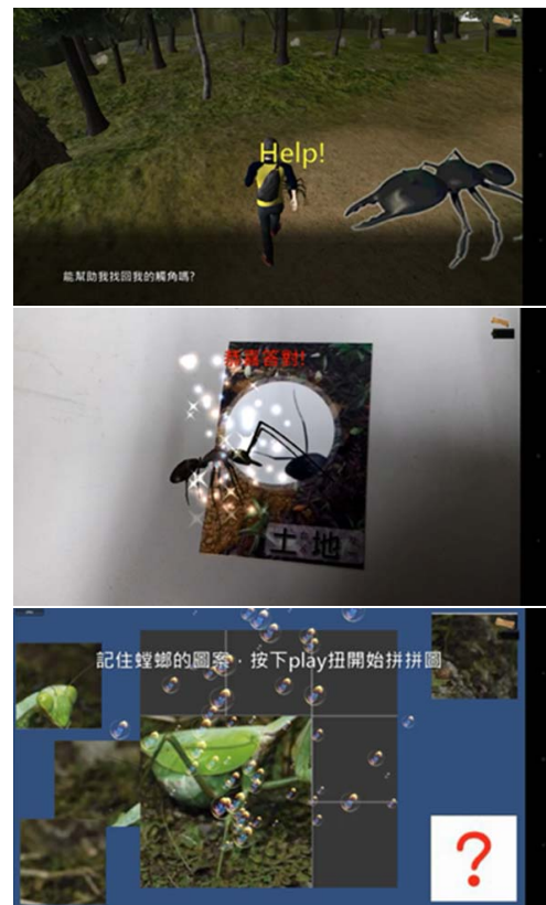
Fig. 3 Puzzle-solving images of the game

in the correct location to complete the task. The puzzle game was utilized to help students observe an insect's physical features and anatomy. Students must position tiles in the correct location to complete each task.