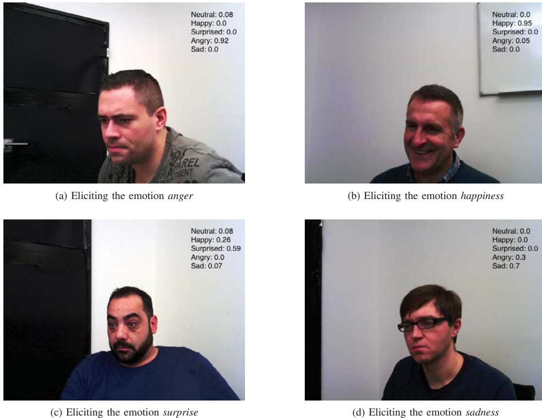
Fig. 4 Scenes captured during the spontaneous emotional reactions experiments where the emotions were elicited by showing emotional video clips. On the upper right corner, the respective scores for each emotion as recognized by Pepper's algorithms

Table III shows the accuracy of the algorithms, represented with percentages of correct detections. The expectations before the experiment were met: "natural" expressions are often more subtle and of shorter duration making them harder to identify. Moreover, more than one could arise simultaneously and even mask one another. This is reflected in the results where the clear tendency is to perform worse for each and every algorithm. Pepper's emotion recognition did recognize 59.83%.