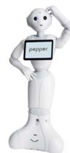
Fig. 1 The Humanoid Robot called Pepper and developed by Softbank Robotics [26]

To assess how the emotion recognition of humanoid robots perform compared to other state-of-the-art solutions, an experiment has been designed and carried out. The robotic platform used is Pepper [26] (see Fig. 1) from Softbank Robotics, an autonomous humanoid programmable robot. This 1.20m tall humanoid robot was specifically developed to interact with humans, what he does through speech and natural body movements which make the communication intuitive. To express itself better and for support purposes, when speech communication is not possible, a tablet is mounted in front of its breast. With its cameras and a 3D sensor, Pepper is able to detect and recognize faces and the environment. Moreover, its great amount of sensors all around its body allow it to move safely and autonomously: infrared, sonars, laser and bumpers. NaoQi is the Unix-based operative system it runs and its behavior is fully programmable in several languages such as C++ and Python, so that new features can be implemented. It connects to the Internet, which allows to integrate any cloud services to extend its capabilities, as well.