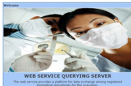
Fig. 4. Interface for Web Service Querying Server

This experiment use WSP to access biomedical image databases for same web user language.