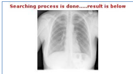
Fig. 6. Interface after searching and retrieving process

Fig. 5 shows interface for searching. Web user is needed to enter information to text field, etc. After that, user is needed to press button "submit". Query server will receive a query from web user. Then, the query server will communicate with query server. The purpose of this communication is to know list of registered biomedical databases before searching and retrieving process. After that, query server will search and retrieve data from the registered biomedical databases. Finally, query server will send the results to web user through WSP.