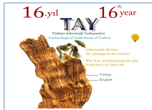
Fig. 1. Tay Project

One of archaeological projects is Tay [4]. This project was developing for archaeological inventory on the Web. A database is created to store and archive the archaeological sites and the findings. This project also provides function is for browsing and searching archaeological data. Web users can search and get information about archaeological easily through this system. Figure 1 shows interface for Tay Project.