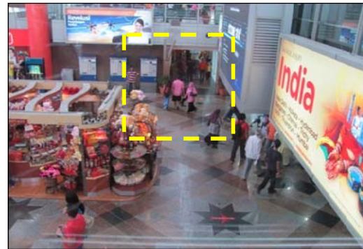
Fig. 2 Overview of the selected area for video recording [12]

The transfer station also has special characteristics to be considered for crowd modelling and simulation such as differences in activities, time pressure and movement patterns [13]. In this research, the focus area was on the exit door (and its surroundings) located at the crowded interchange connecting the public transportation system including trains, buses and taxis within the transportation hub. An overview of the selected location is shown in Fig. 2 where there is a ticket machine, a stall and a shop located at the exit door area (highlighted area). The exit door was selected for the research since the area can supply considerable human movement and behaviour in a crowded area.