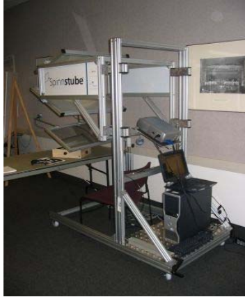
Fig. 1 A module of the ARiSE platform

The project will implement three prototypes based on three interaction scenarios. The 1st prototype is targeting Biology.