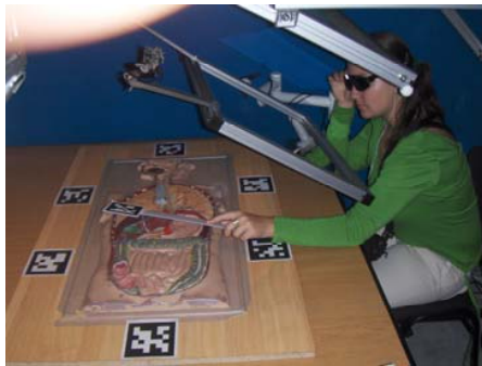
Fig. 2 User performing the 1 st exercise

Five user teams from 4 countries (Germany, Lithuania, Malta and Romania) participated at the summer school with a total of 20 students from which 10 boys and 10 girls. None of the students was familiar with the AR technology. 16 students were from 7th form (13-14 years old) and 4 from 11th form (16-17 years old).