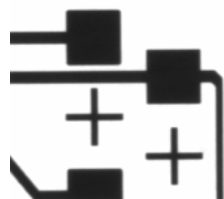
Fig. 4 Synthetic image for evaluating accuracy

a & b: AOI images for registration; c & d : matched line segments; e & f: binary difference images for gray level threshold value 30