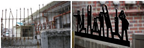
Fig. 6 Revitalization of the street through community design [5]