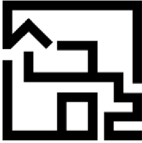
Fig. 9 So-geum-gil(Salt road) Symbol mark[5]

In the map of the ‘Salt road’, marked in yellow is course A which is 1.1 km, and marked in light blue is course B which is 0.6 km. Each course has different themes such as meditation road, power walking, healing point, resting area, etc. In the area where course A and course B meets, there is a place called the ‘So-geum-na-ru (salt port)’. This area is open 24 hours a day. It is not only used as a surveillance area, but also a 24 hour convenience store where residents can easily purchase good and medicine, even at late hours.[5]