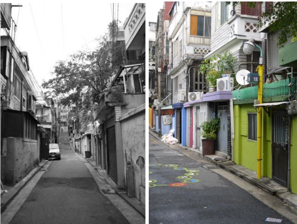
Fig. 7 Revitalization of the street through community design [5]

The Seoul metropolitan government and the crime prevention design team first decided to survey the resident's insecurity of crime and create an 'insecurity map'. As reflected in this map, they identified the places where people felt most fear they were able to make walking areas and improve the environment of the 'insecure' areas.[5]