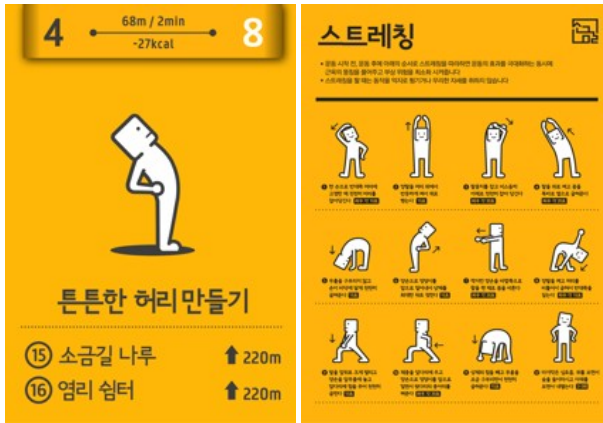
Fig. 10 Exercise program guide of So-geum-gil [5]

In the map of the ‘Salt road’, marked in yellow is course A which is 1.1 km, and marked in light blue is course B which is 0.6 km. Each course has different themes such as meditation road, power walking, healing point, resting area, etc. In the area where course A and course B meets, there is a place called the ‘So-geum-na-ru (salt port)’. This area is open 24 hours a day. It is not only used as a surveillance area, but also a 24 hour convenience store where residents can easily purchase good and medicine, even at late hours.[5]