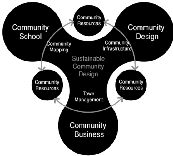
Fig. 4 Sustainable Community Design [3]

of community mapping, each region can have its own community infrastructure, and each region can have town management activities to foster businesses in each community.[3]