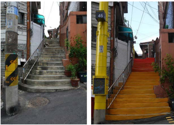
Fig. 5 Revitalization of the street through community design [5]

Before any further analysis, this paper will describe the specific details of the crime prevention design project. This project was launched in Seoul to revitalize the community and to promote natural surveillance to prevent and control crime. It enabled residents to live peacefully in crime-ridden districts.