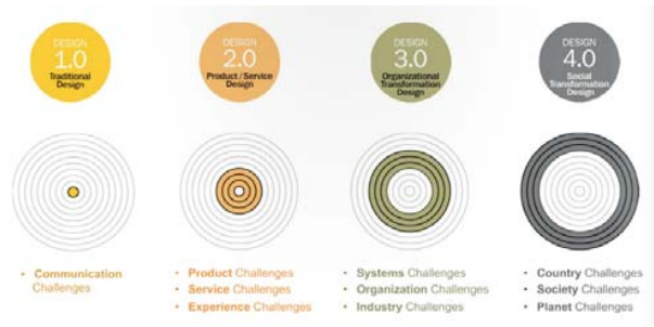
Fig. 2 Challenge Scale [8]

The community design has the properties of Design 4.0, which is the emerging design these days. Depending on social change, the meaning of design also has changed from the traditional product-centered design to the human-centered design through user participation. In this flow, NextD presented a framework about Design 1,2,3 and 4. Design 1.0 is traditional design as making. Design 2.0 is product and service design as value creation and design integrating. Design 3.0 is requires a inclusive design process as organizational transformation design.[6] And design 4.0 is social transformation design. In Design 3.0 and Design 4.0 there is more need for open challenge framing, more need for deep local human-centered sensemaking. Design 4.0 has challenges of country, society and planet.[7]