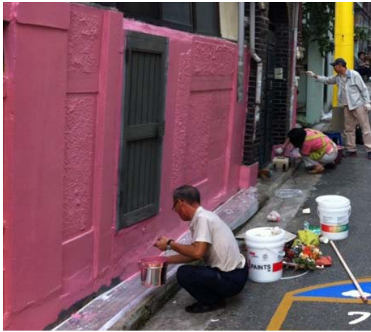
Fig. 12 The residents who participated in ‘Alley Atelier’ Project [5]