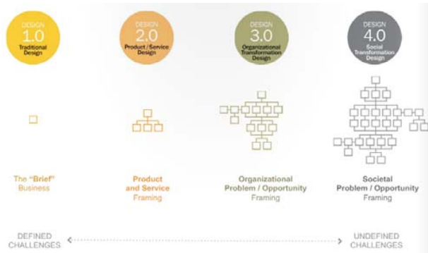
Fig. 3 Challenge Fuzziness Shift [8]

On the other hands, Korean academics have been talking about how the Public Design 1.0, which is to design public spaces in the traditional method, has changed to Public Design 2.0. There are three purposes to public design 2.0. First is for the government, design specialists, and the civil society to have seamless communication and cooperation. Second, is to have a design that has a long-term infrastructure in the perspective that public projects' resources should not be wasted because it uses the people's taxes. Third, is to make a more elaborate process which includes the vision, mission, and action plan, etc.[1] To fulfill the three purposes of public design 2.0, the participation of the people will be necessary, and it is expected that the community design will encourage participation, moreover, work as the role model for the public design.