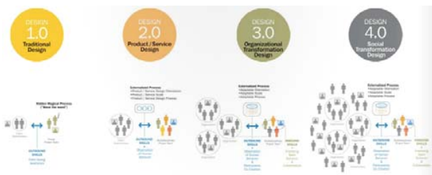
Fig. 1 When Design Begins is changing [8]

The information above mentions that community design is a form of citizen participation type design that forms communities and promotes regional revitalization. Community design is composed of design through participation, people sharing the same goal of improving the quality of the design method, and the behavioral environment.[9] Community resources, the community, and community design activities allow sustainable community design to work. Community resources are based on the features of the area and can be made through Place Making. Also, the community can be divided into the community school, community design, and community business. Each of these factors plays an important part in the community design and they affect each other. Through community design activities community schools can make use