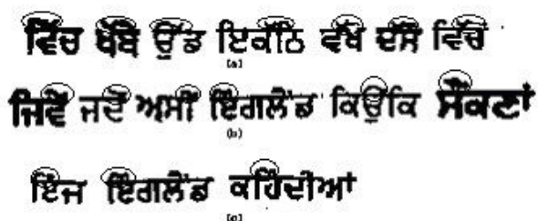
Fig. 5 Gurmukhi words containing touching characters in upper zone (touching characters have been marked with circles)

Following three categories are being proposed in the upper zone for touching characters.