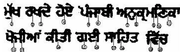
Fig. 4 Words containing touching characters in middle zone

structural properties of the Gurmukhi script, various touching characters can be classified among few categories. Some characters also fall in multiple categories. For each pair of touching characters, these categories are defined on the basis of left character of the pair. These categories are now briefly described.