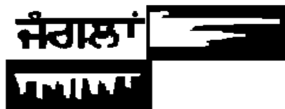
Fig. 5 Horizontal & Vertical Projection of a touching word