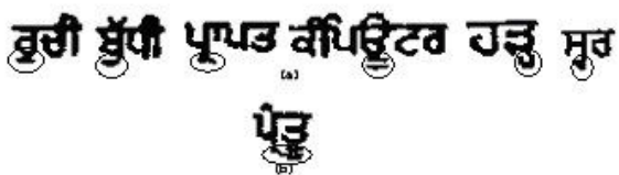
Fig. 6. Touching characters in lower zone (touching characters have been marked with circles)

Based on the analysis, we consider the following two categories in lower zone