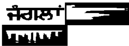
Fig. 6 White dots showing start of headline, end of headline and possible positions of sidebar Columns

One can see horizontal and vertical projection of a word having touching characters in fig 5. Also, start of the headline and end of the headline in fig 6 have been marked by white marks in horizontal projection area. The possible positions of sidebar columns in fig 6 are marked by white marks in vertical projection area. Now we put a white line after these positions and segmentation is achieved as shown in fig 7.