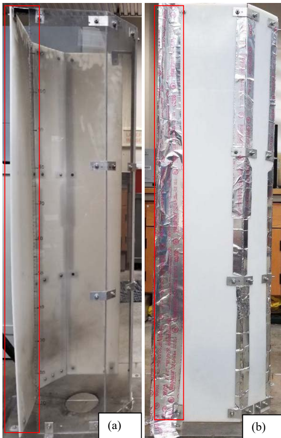
Fig. 1 Small-scale experimental setup (a) front view, (b) back view

the fuel container was placed in the middle of the setup. Having fire in this specific setup, the fire tornado would appear after a short time after igniting the fuel. A fire whirl consists of a burning core and a rotating pocket of air. Whirling eddies of incoming air from the slits lead to the rotation of the hub for the setup, which subsequently causes fire whirls to form. The small pit of fuel with diameter of 11 cm was placed in the middle of the setup, where it is leveled with the column bottom by creating and placing it into a hole. For each of the experiments, a mix of fuel and water was poured in the pit. Due to its affordability and safety advantages, Hexane was chosen as the fuel for all the experiments. Regardless, it has been proved that the fuel selection has less impact on fire propagation for this setup [15]. A normal aluminum tape was used to tape the slits to the desired heights. To simplify the task of blocking the two air entrances, one of them was totally taped before starting the experiments and the other one was left intact to allow changes in the height over the course of the study.