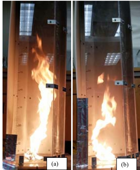
Fig. 3 Fire which was formed for cases with height factor of 1.36, (a) and, 3.18, (b)

The significant effects of the covered slit height, however, can be seen more clearly in Fig. 3, where the fire tornado formed in two different cases are compared. This figure shows the difference between the maximum height achieved by the fire in two different cases of height factor of 1.36 and 3.18. Fig. 3 (a) shows that in case of H^* = 1.36 , there is still a strong fire tornado formed in the setup. In the 3.18 case, presented in (b), however, the fire whirl has some features of wandering fire as well instead of being a strong fire tornado. The pulses in fire tornado of case 3.18, were more frequent than the ones with 1.36, which is believed to be behind the fire being weaker. In general, this behavior was observed in for cases with higher heights. Additionally, the maximum height achieved by the fire whirl, which is considered to be one of the factors of the fire strength, has changed significantly in different investigated cases. For instance, the fire height was recorded to be 81.3 cm, 72.5 cm, 49.8 cm and 18.1 cm for cases of 0, 1.36, 3.18 and 10.91, respectively. By taking a closer look, for instance, blocking the slit height from fully open to case 3.18 (about 29% of the setup height), the maximum fire height was changed about 39%.