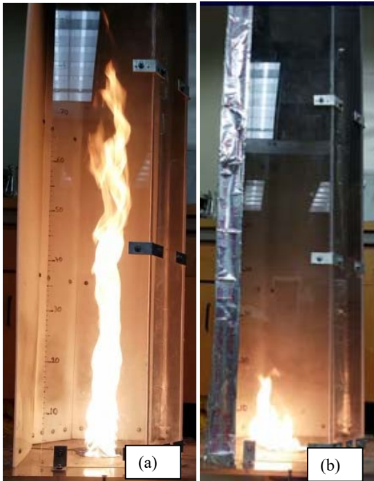
Fig. 2 Fire which was formed, (a) when one slit was totally left open, (b) when both slits were totally taped

totally open, while (b) presents the type of fire that was formed when both slits were totally taped, which is, as discussed, behaves like a pit fire, however, with some slight differences. In this case, there were marginal pulsing and it is believed that these pulsations are mainly due to non-uniform nature incoming air stream and subsequent flame form.