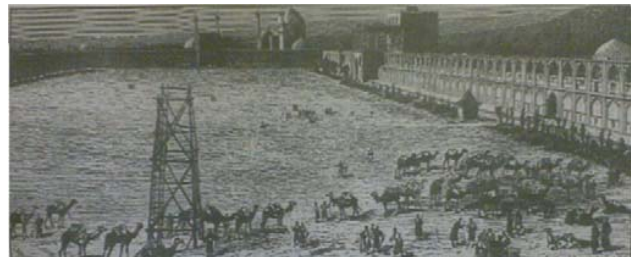
Fig. 3 Quality of Naghshe Jahan Square in Qajar era, [8]

Naghshe Jahan square after Safavi period In the Qajar era, in the overall structure of the city center (Naghshe Jahan Sq.) had not much changed, but in all aspects which included the construction of buildings, urban activities and the economics of the place loss dramatic prosperity. The most important document in this field was in the late Qajar period which had been shown in a map of the Sultan Syed Reza khan in 1302 AD (1923). According to Ojhen Finlanden and Rene Dalman, French and Germany explorer in Qajar era, most of the shops around the which worked in Safavi period was demolished and some of them used as Storage, stable and coffee house. (Fig. 3)