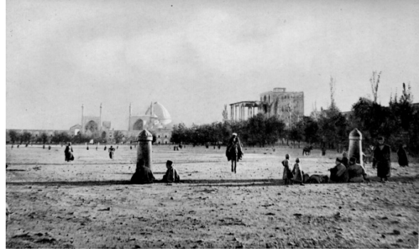
Fig. 2 Naghshe Jahan Square in Safavi era as city center, [8]