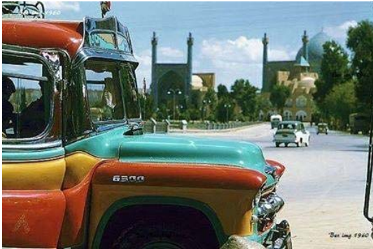
Fig. 6 Increase of vehicle accessibility in Naghshe Jahan square in Pahlavi era, [26]

according to decisions of supreme traffic council of Isfahan in April of 2014, entry of any motor vehicle such as car, bus and motor cycle to the square was forbidden. (Fig. 8) So after passing around 80 years, Naghshe jahan square returned back to the origin condition from accessibility perspective and use as powerful historical city center in Isfahan. Also by this action most of the unworthy urban elements from visual view will remove.