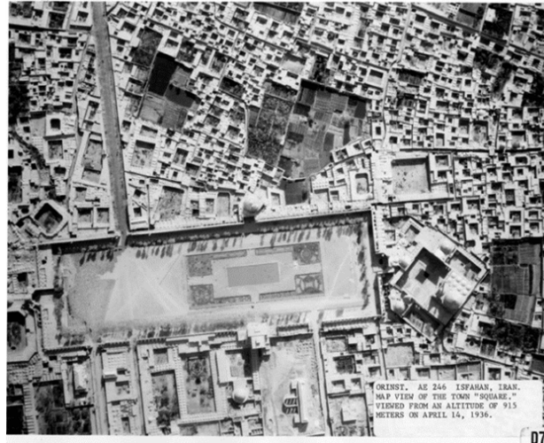
Fig. 5 Naghshe Jahan Square Bird view in 1937, [24]

situation which had not any vitality in urban life. Likewise changed the area as the most powerful public space to attract citizens and visitors. Also there was more attention to the restoration of historical buildings and facade of the square as well as revitalization of the urban space. Architectural revitalization had much effect on the public and commercial activity of the city center which missed in Qajar era as a strong city center.