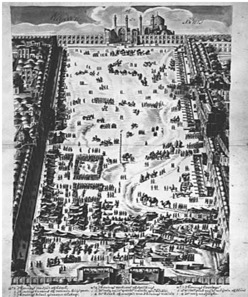
Fig. 1 City center activity in Safavi era, [8]

Naghshe Jahan complex which has been known as the new city centre "is a clear and beautiful expression of symbolism and innovation in city planning" [13]. The complex is a compilation of a Great square (1700-525 ft.), Ali Qapu (government centre), Imam Mosque (Masjed- Jame- Abbasi), Sheikh Lotfollah Mosque, Qeysarie Bazaar, public buildings (i.e. bath, school, pool, and etc.), CaharBagh Garden, ChaharBagh Street and residential quarter. (Figs. 1, 2)