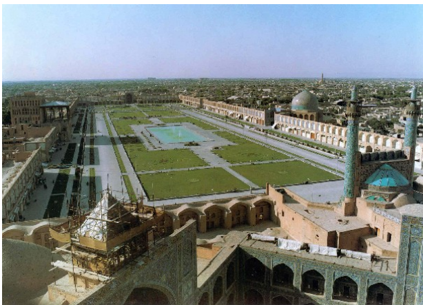
Fig. 7 Naghshe Jahan square in 2014, [26]