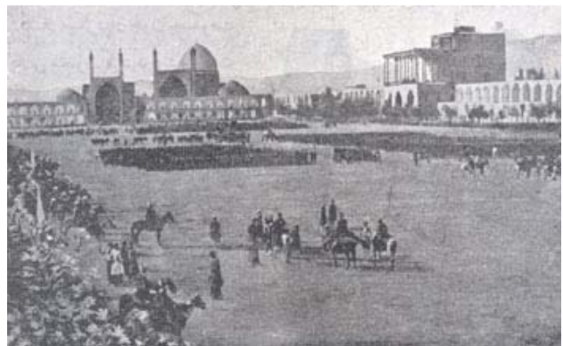
Fig. 4 Naghshe Jahan Square as military camp in Qajar era, [22]

Some of the shops rented by foreign traders but generally