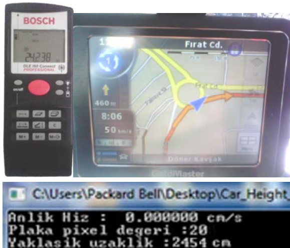
Fig. 2 First Application of increasing speed