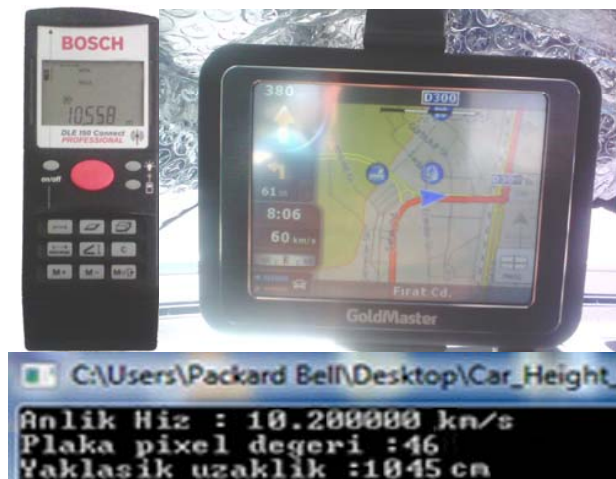
Fig. 3 Second Application of increasing speed