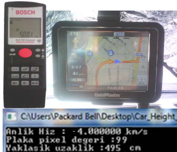
Fig. 4 Second application of slow down speed