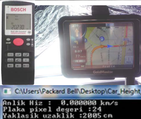
Fig. 4 First application of slow down speed