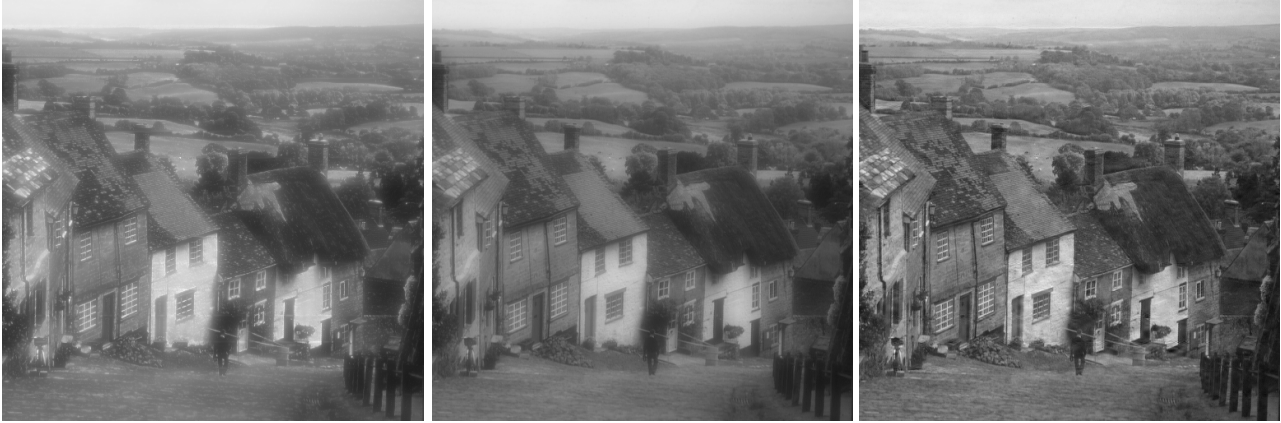
Fig. 1 Fusion results, the original image blurred in stripes. Top: input image X (one half of stripes in the original image blurred, left), input image Y (other half of stripes in the original image blurred, middle), fused image F using averaging (right). Bottom: fused image F using ratio pyramid decomposition (left), fused image F using the PCA decomposition (middle), fused image F using DWT domain fusion (right)