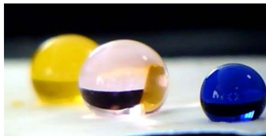
Fig. 3 Sessile water droplets on the nanofiber surface

This is important in cases like micro-liquid droplet transportation, protective coatings, biochemical separation, and so on [12].