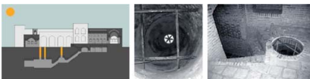
Fig. 6 Darize (a cylindrical vertical duct)

In Shovadan, the temperature of Kats and wide stairs, that have less depth than Sahn, is more than the temperature of Sahn [2]. The underground connection between neighboring Shovadans and having access to the riverside through the underground way for avoiding the intense solar radiation during summer days and for defense against enemies caused the formation of an underground life in Dezfoul city. During the hot days of summer social connections were made in Shovadans.