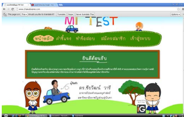
Fig. 2 The Multiple Intelligences Measurement Online