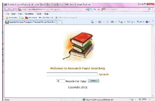
Fig.2 Research Paper Searching web page.

Where n_{i,j} is the number of occurrences of the considered term in document d_j . |TTA| is the total number of documents in the corpus. |\{d: t_i \in d\}| is the number of documents where the term t_i appears (that is n_{i,j} \neq 0 ). If the term is not in the corpus, this will lead to a division-by-zero. It is therefore common to use 1 + |\{d: t_i \in d\}| .