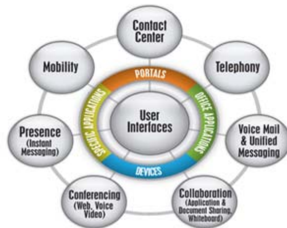
Fig. 2 Conceptual Diagram of UCIC Places User in the Middle

UCIC is built around simplifying user experience and giving users what they want. Thus, a diagrammed depiction of UCIC rightly places the user in the center shown in Fig. 2. With UCIC the user can easily access many services (conferencing, collaboration, unified messaging, etc.) via devices, web portals, desktop applications and special applications.