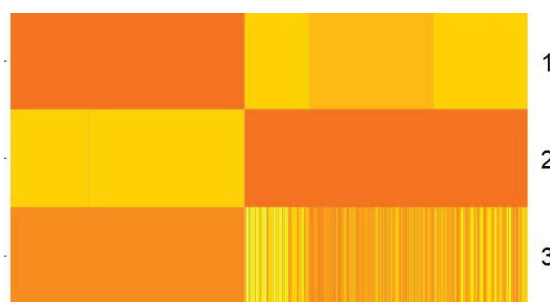
Fig. 3 Weight matrix W_1 by DNMF

The left half of the weighted matrix is for PayPay users, and the right half is for LINE Pay users. The darker the color, the higher is the degree of affiliation.