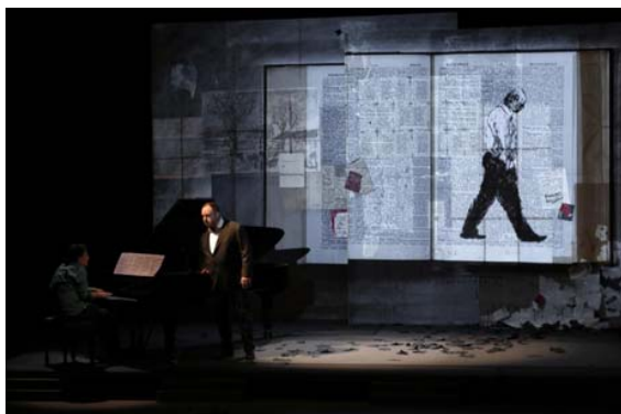
Fig. 10 William Kentridge, Winterreise , 2015, stage performance

Maybe the passionate effect of the singer performing on stage, the outcome of his overwhelming voice in a visual moving scenery leads to its crucial outcome. The whole environment increases reactions and passions towards a highest compulsive adherence. Maybe, all along these centuries, although the known differences in society, people still feel the pursued drama - loneliness, nostalgia, delusion and melancholy - with quite similar intensity (and urge).