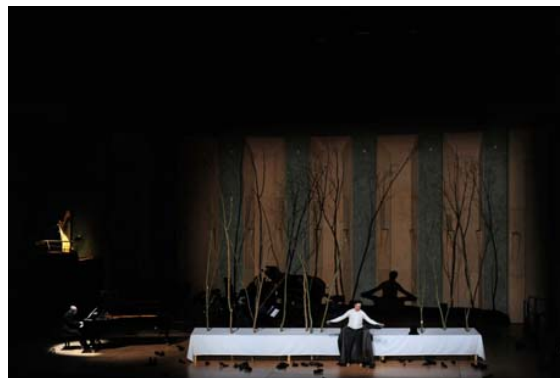
Fig. 9 Michael Borremans' Winterreise , 2014, stage performance

work whose publication does honour to the poet, the composer, and the publisher. Schubert has displayed a genius in his interpretation of the poet. He has truly appreciated the emotions expressed in these poems and reproduced them in music which none can sing or hear without being deeply moved [14].