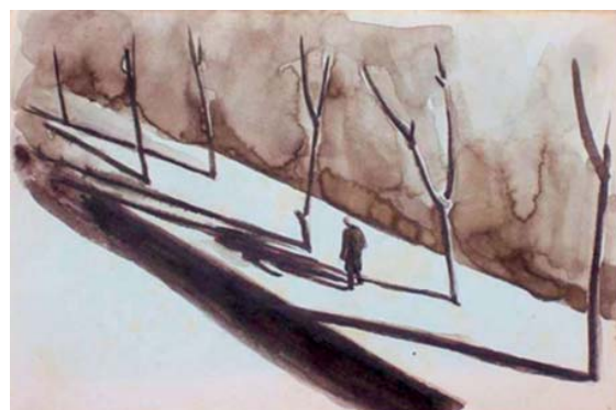
Fig. 3 Michael Borremans, Winterreise , 2014, painting

connaître le monde sans sortir de chez soi 1 [3].