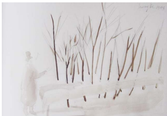
Fig. 5 Michael Borremans, Winterreise , 2014, painting

The aesthetic experiences are developed thru unexpected energies which emerge according to the empathies the artist or composer discovers. The process of creation implies research and emotions connected in harmony, accomplishing a journey the author wants to apply for. We could say that almost every artistic creation develops from a winter journey [ Winterreise ], as an ultimate journey that leads and – at in parallel - runs against dead and oblivion.