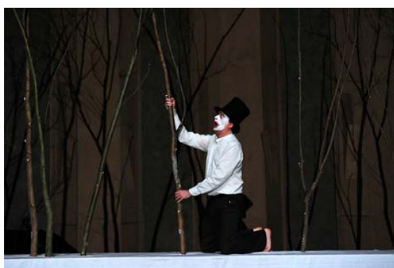
Fig. 6 Michael Borremans, Winterreise , 2014, stage performance

Borremans overcame as a genius. The visual imagery (and iconography) he created for Winterreise had its première in 2014, a production of the Muziektheater Transparant and Ensemble Intercontemporain for the Klara Festival, Bozar, Cité de la musique, in Belgium. The Belgian Artist presented a powerful Winterreise , creating scenery and wardrobe and set it on stage as though he was making an overwhelming installation, a grand and crucial Umwelt . Borremans' production was so huge and moving that the public would like to jump into transcendence and ensure a lap over human existence. When looking at the video registration of the Première , we immediately notice the intensity of two presences – the singer and the pianist are absolute. They come with perfection their technique and conduct us – as viewers and spectators – towards a realm where chronology as no meaning and ensures all the possible contents of inner-consciousness.