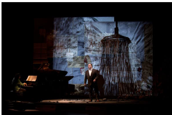
Fig. 1 William Kentridge, Winterreise , 2015

The South African artist, in an interview for the New York Times , said: “This “ Winterreise ” is a “celebration of incomprehension,” a defense of the “half-understood” [2]. Nothing is only what it seems to be. William Kentridge was seduced by German Lieder since childhood though he did not understand the language. He was compelled by the composition and – when invited to create his version – recovered his childhood memories and turned it into black and white images produced in a cinematic mood for the stage performance.