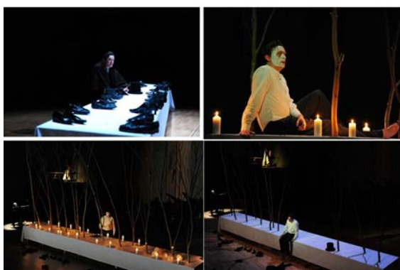
Fig. 8 Michael Borremans, Winterreise , 2014, stage performance