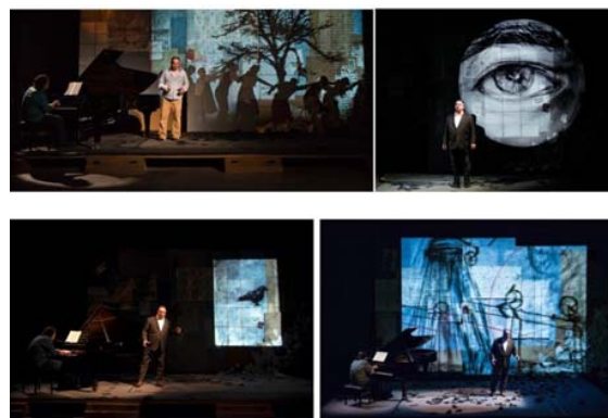
Fig. 7 William Kentridge, Winterreise , 2015, stage performance

characteristics, which established both Wilhelm Müller's text - narrated along the 24 poems, and the iconography, illustration held according the subject. William Kentridge conceived 24 ink drawings and collages to which gave movement, projected in a huge screen as 24 stop-action films. The technical procedure was similar to the ones the Artist usually applies in his video-installations and films. The Première happened at the Salzburg Festival in July 2014, with the baritone Matthias Goerne and the pianist Markus Hinterhäuser as leading figures.